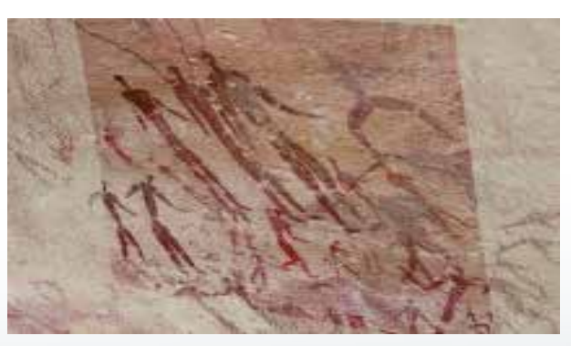
Cave paintings in Wadi Sura

This enables a subsequent comparison between the revamp design and the as-built site. One other advantage is that the scan-ner can operate in a temperature range of -10 °C to +45 °C.