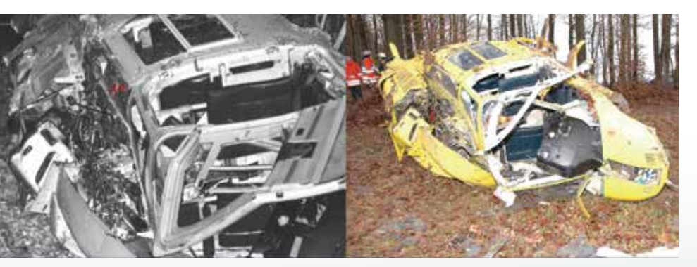
Helicopter crash Regional CID Baden-Württemberg

The protection class IP 53 means that the scanner is not affected by splash water or dust. The low measurement noise guarantees a detailed and precise evaluation of the forest land.