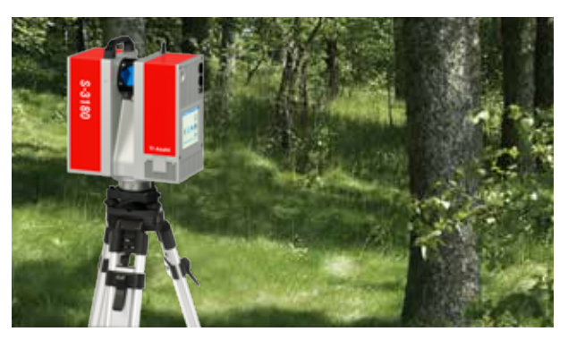
Scanning sample areas

The optional M-Cam enables the whole point cloud to be coloured, which gives a photorealistic impression of a scan with a high level of detail. The low noise level means that despite long distances, a very high data quality and scan resolution can be achieved and even small details can be captured.