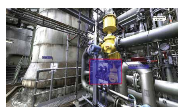
BubbleView® in LFM

The enormous scan rate and high resolution allow the Scanning System to quickly "freeze" scenes for later analysis and in extraordinary quality. In this case, the data serves mainly for preserving evidence and documenting damage. Using the LFM/LaserControl software, the scenes can then be visualized afterwards. This leads to great time savings for accident reconstruction, checking plausibility where manipulation is suspected and many other purposes of insurance interest.