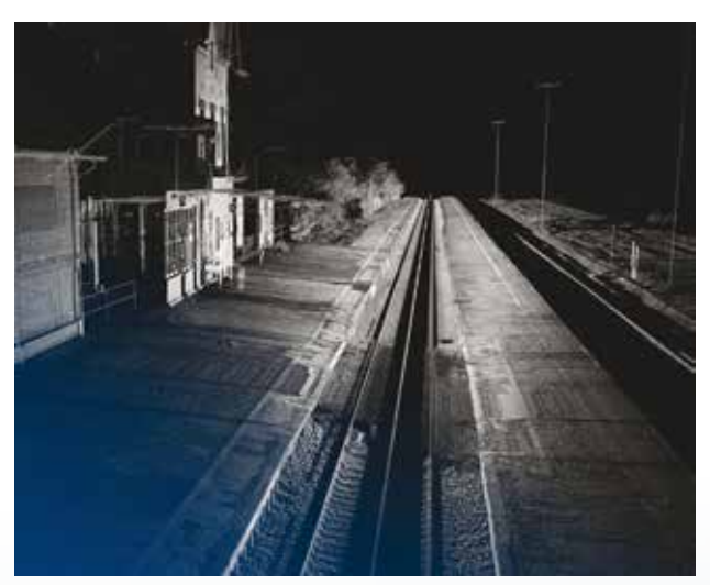
The PROFILER is also suitable for use on fast-moving mobile platforms like trains.

The S-3180 is equipped with a colour touch screen and intuitive operating concept. By just two clicks, the S-3180 can be configured and started.