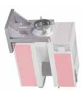
Mounting bracket for overhead use of the S-3180 available as accessory.