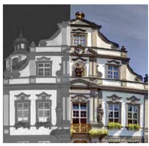
Town hall Wangen in Allgäu in 3D view

At the scene of an accident, for example, all the relevant data can be gathered very quickly without interrupting the work of the police or rescue teams. Downtimes of production plants can similarly be reduced to a minimum.