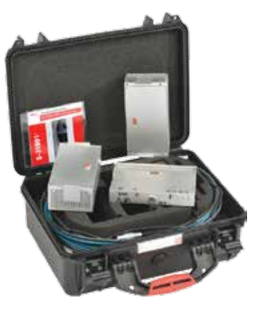
The hard case ensures the safe storage of the accessories

Every S-3180 laser scanner comes complete with an accessory case that includes the following items: