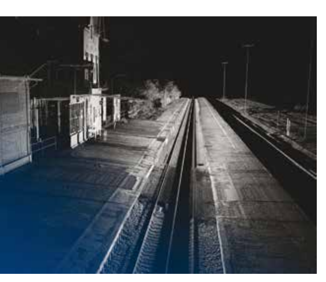
Sample data of the Wangen station captured within a few seconds

A hardware-assisted pixel-by-pixel synchronization, already used and tested in previous models, makes it possible to process external signals to determine the position of the scan data.