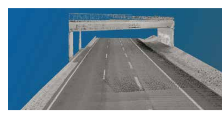
Sample data of a highway